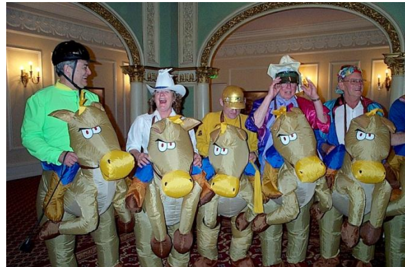
Unknown bunch of Lions in Spokane