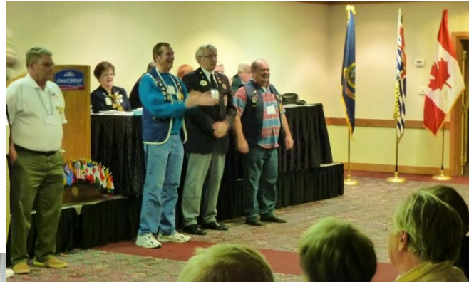
Unknown bunch of Lions in Spokane

One of our own declaring Victory somewhere somewhen