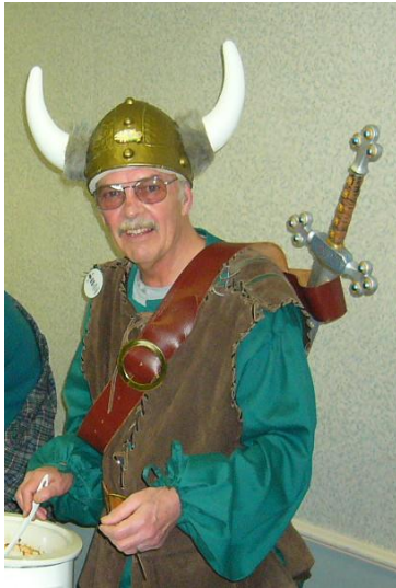
1 st Spouse in Tacoma (2006)

One of our own declaring Victory somewhere somewhen